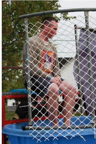
This is another example of true Jumper Spirit!