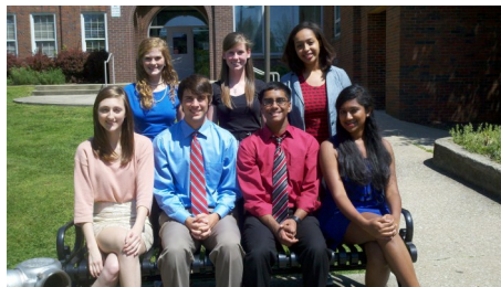
Somerset's Governor's Scholars